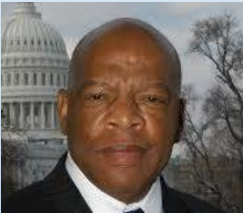
John Lewis American civil rights leader who served in the United States House of Representatives.

Some of our prominent members are listed below: