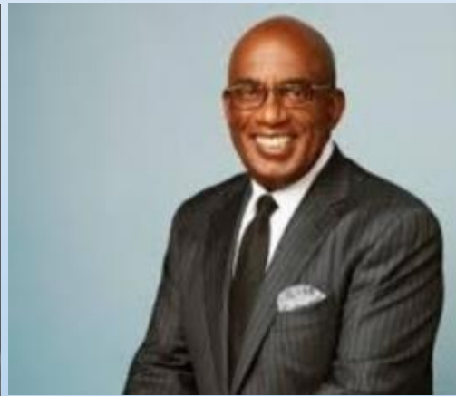
Al Roker is an American weather forecaster, journalist, television personality, actor, and author.