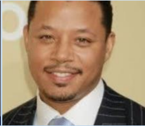
Terrence Howard is an American actor, rapper, singer-songwriter, and record producer.