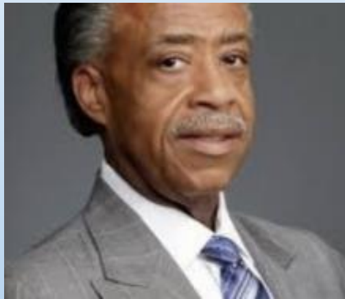
Rev. Sharpton is an American civil rights activist, Baptist minister, talk show host and politician.