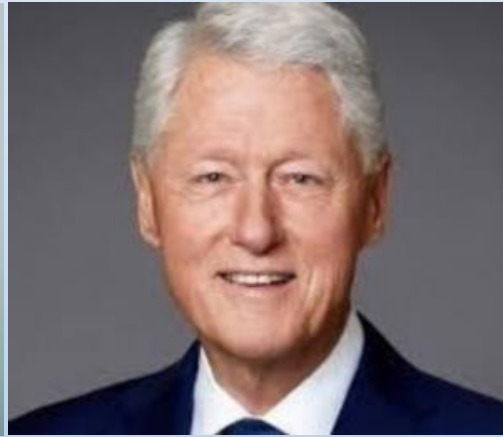
William Jefferson Clinton is an American politician who served as the 42nd president of the United States from 1993 to 2001.